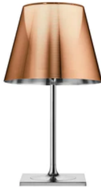
Table luminaire providing diffused lighting. Base, rod support and diffuser support in diecast, polished and chrome-plated Zamak alloy. Base cover in black injection-molded PA (Nylon). Injection-molded PC (polycarbonate) opal inner diffuser. Outer diffusers in transparent or fumée PMMA (polymethylmethacrylate), and silver or bronze on the inner surface, by vacuum aluminum coating. Injection-molded PC (polycarbonate) upper ring, completely transparent or transparent diffuser and silver diffuser) or transparent brown for the outer bronze diffuser.