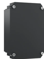
Box for installation for masonry or concrete wall F5962000