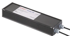
Power supply 24Vdc 50W / 120-240V IP67 Class II selv. Non Dimmable RF25755