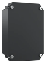
Box for installation for masonry or concrete wall F5962000