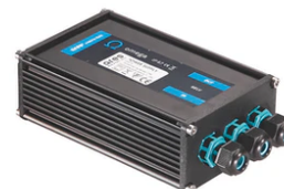
Power supply 24Vdc 20W / 110-240Vdc (15W@110V) IP67 Class II selv. Dimmable DALI RF26387