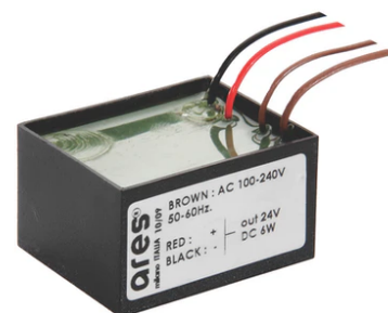
Power supply 24V 8W / 110-240V IP65 Class II selv. Non Dimmable RF25748