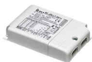
Power supply 24Vdc 17W / 110-240V (15W@110V) IP20 Class II selv. Dimmable 1-10V RF25750