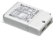
Power supply 24Vdc 17W / 110-240V (15W@110V) IP20 Class II selv. Dimmable 1-10V RF25750