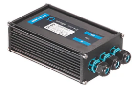
Power supply 24Vdc 20W / 110-240Vdc (15W@110V) IP67 Class II selv. Dimmable DALI RF26387