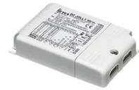
Power supply 24Vdc 17W / 110-240V (15W@110V) IP20 Class II selv. Dimmable 1-10V RF25750