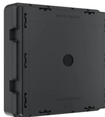
Box for installation F4303000