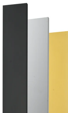
Anodized aestetel pole screen Anodized Gold F002Z050073