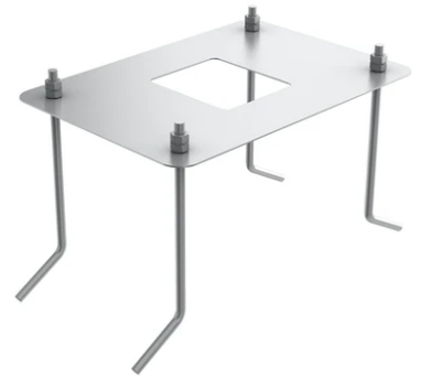
Base plate with bolt F1209000