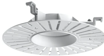
Installation Frame No Trim 08.0166.00