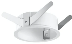
Installation Frame Trim 08.0164.40