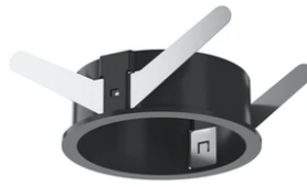
Installation Frame Trim 08.0164.14