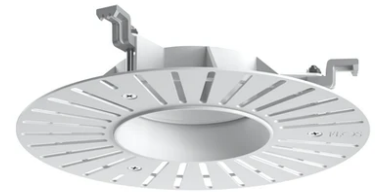
Installation Frame No Trim 08.0166.00