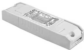
Non dimmable continuous current power supply of 220/240V – 50/60Hz with power current selected through adjustable with switch 200 mA – 8,5W / 300 mA – 13W / 350 mA – 15W / 400 mA – 17,5W / 450 mA – 19,5W / 500 mA – 22W 60.9160