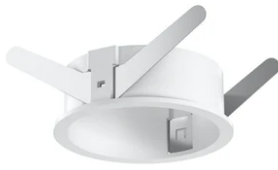
Installation Frame Trim 08.0164.40