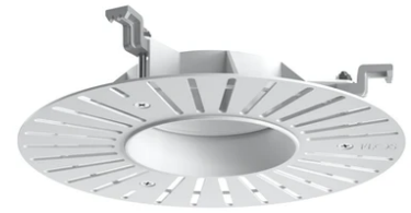
Installation Frame No Trim 08.0166.00