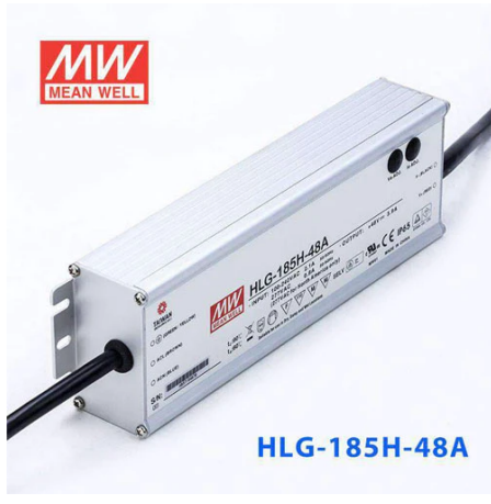
RF29209 HLG – 185H – 48A