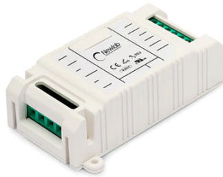
RF26994 Dimmer Led