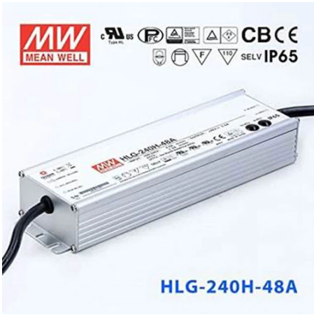
RF27617 HLG – 240H – 48°