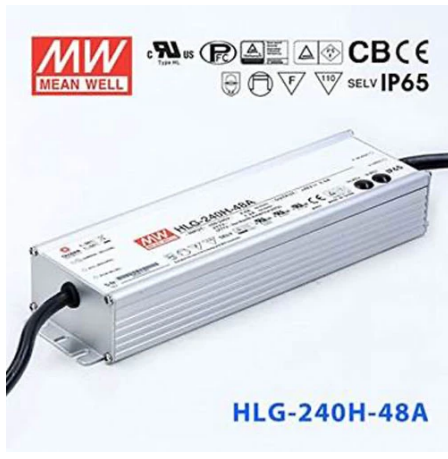
RF27617 HLG – 240H – 48°