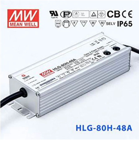
RF29208 HLG – 80H – 48A