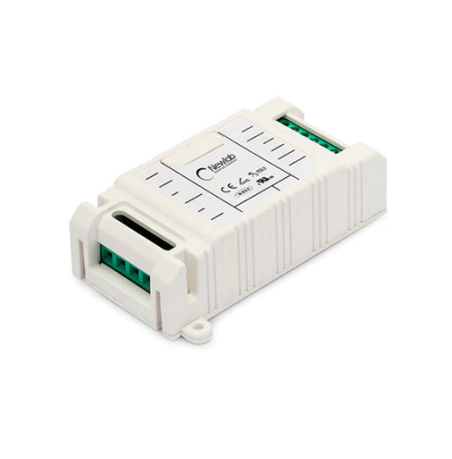
RF26994 Dimmer Led