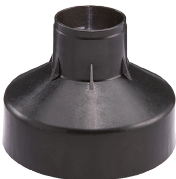
Box for Installation Rho 169