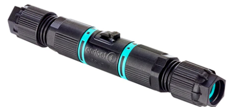
2 Way Terminal Block 2 Poles Ip68 H2O Stop 269