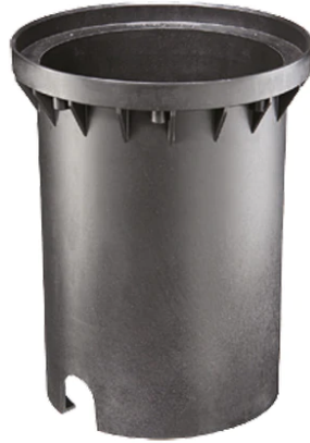
Box for Installation Petra/Idra 26