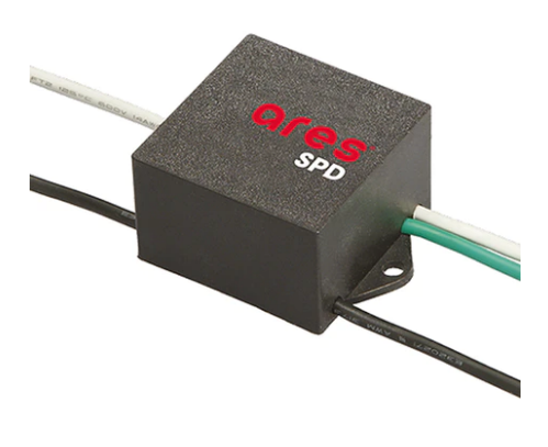
SPD (Surge Protection Device) 237