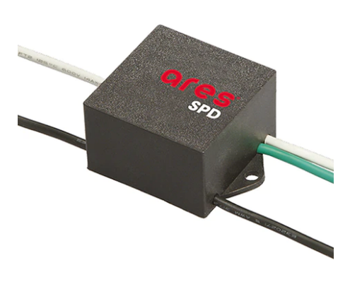
SPD (Surge Protection Device) 237