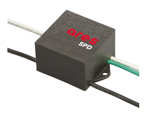
SPD (Surge Protection Device) 237