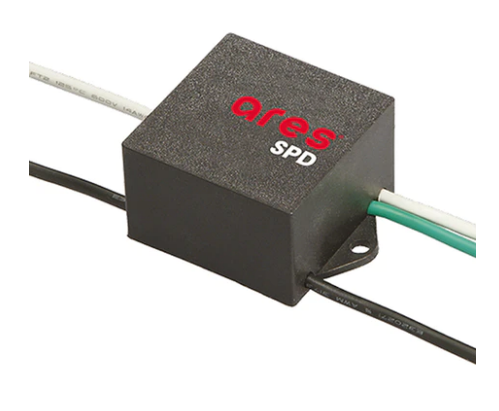
SPD (Surge Protection Device) 237