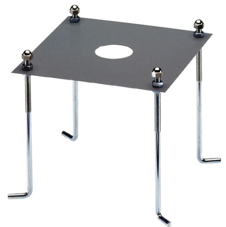
Base Plate and Fixing Bolts for Pole Ø 102 mm h 4000/5000 mm with Base 116