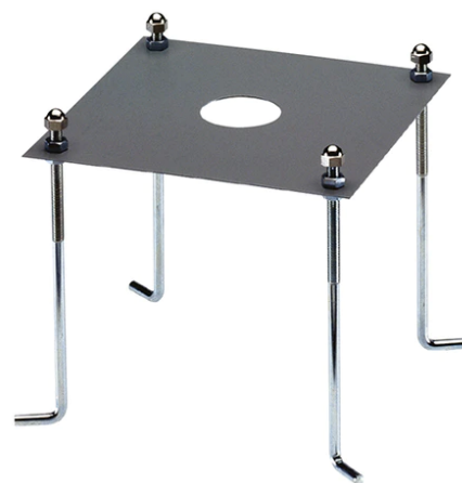
Base Plate and Fixing Bolts for Pole Ø 102 mm h 4000/5000 mm with Base 116