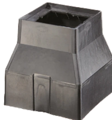
Box for Installation Bea 42