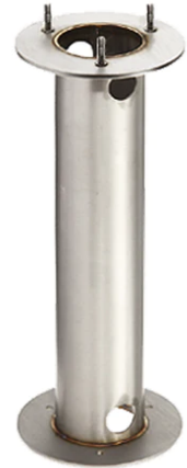
High Resistance In-Ground Fixing Base Zefiro/New Torcia 185.A