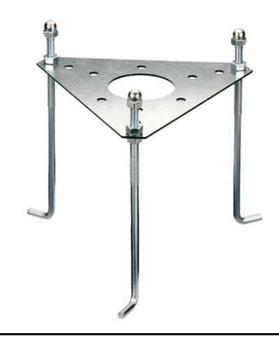
Base Plate and Fixing Bolts Silvia/Mini Silvia pole 21