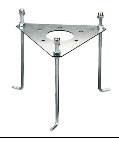
Base Plate and Fixing Bolts Silvia/Mini Silvia pole 21