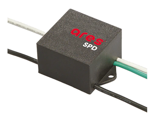
SPD (Surge Protection Device) 237