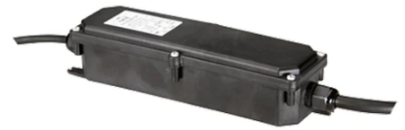
Power Supply 70W 220÷240V/24Vdc Ip67 110