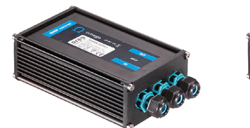
Power Supply 17W 110÷240V/24Vdc Ip20 144

Power Supply 10W 110÷240Vac/24Vdc Ip67 175