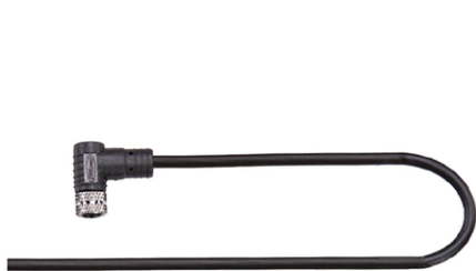
Supply Cable Tau Tube L 2000 mm Single Connector 172