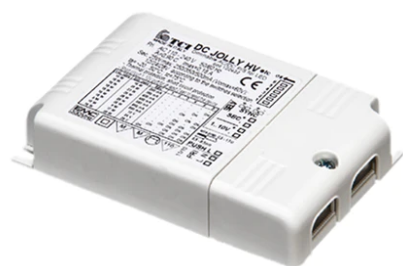
Power Supply 17W 110÷240V/24Vdc Ip20 144