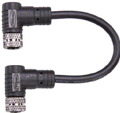
Supply Cable Tau Tube L 80 mm Double Connector 173