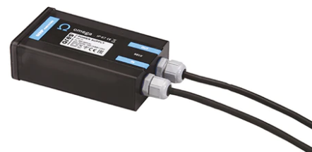
Power Supply 20W 220÷240V/24Vdc Ip67 147