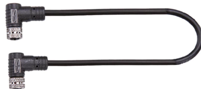
Supply Cable Tau Tube L 200 mm Double Connector 174