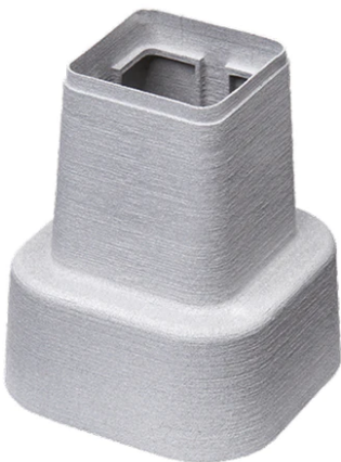
Box for Installation Tapioca Square 40X40 99