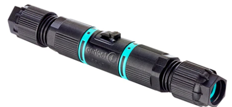
2 Way Terminal Block 2 Poles Ip68 H2O Stop 269