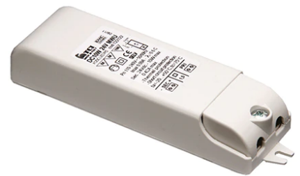
Power Supply 10W 110+240Vac/24Vdc Ip20 87