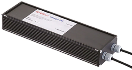
Power Supply 50W 120+240V/24Vdc Ip67 155