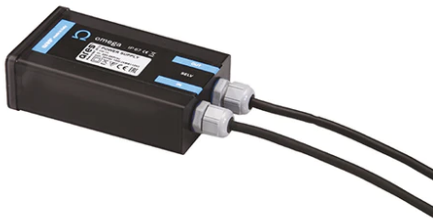
Power Supply 20W 220+240V/24Vdc Ip67 147