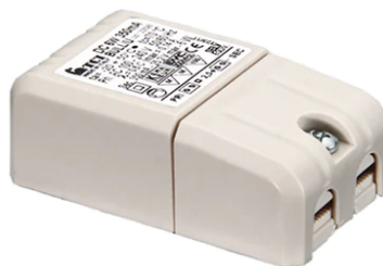
Power Supply 8W 100+240Vac/24Vdc 350mA Ip20 150