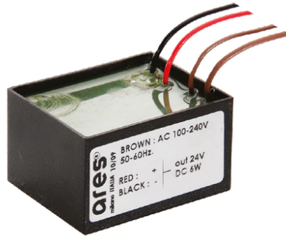
Power Supply 100+240Vac/ 8W at 24Vdc/ 6W at 350mA Ip65 106