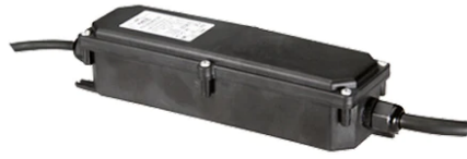
Power Supply 70W 220+240V/24Vdc Ip67 110