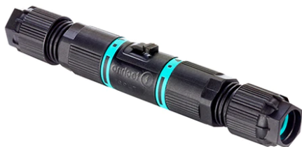
2 Way Terminal Block 2 Poles Ip68 H2O Stop 269