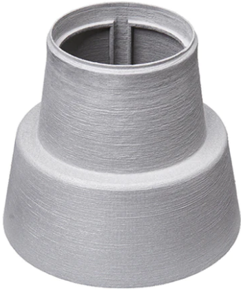
Box for Installation Tapioca Round \varnothing 70/90 101