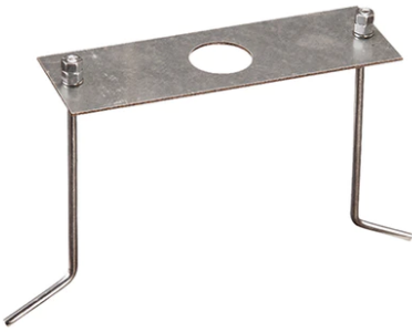
Base Plate and Fixing Bolts Talia 139