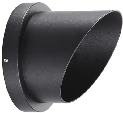
Visor Spock 130 207.4