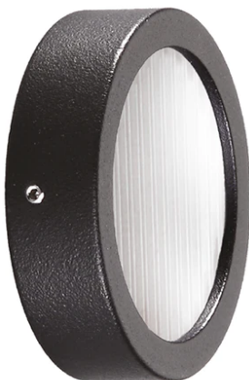
Elliptical Lens Spock 130 263.4