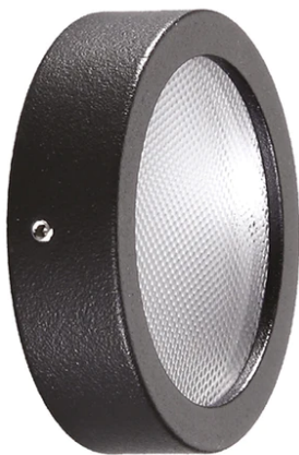
Flood Diffuser Spock 130 210.4