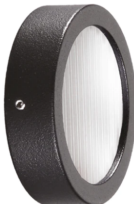
Elliptical Lens Spock 130 263.4