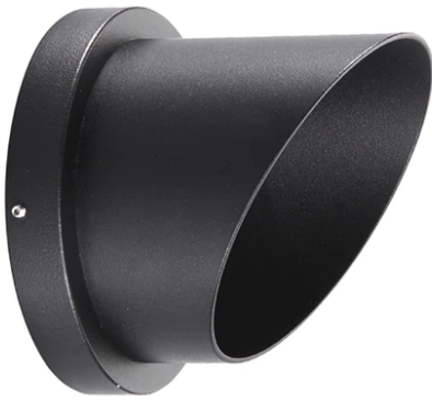
Visor Spock 130 207.4