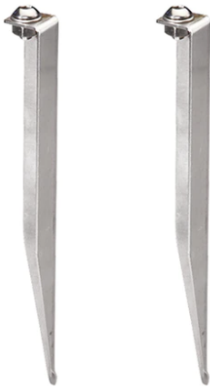
Kit Ground Spikes Spock 75/Spock 95/Spock 130 203