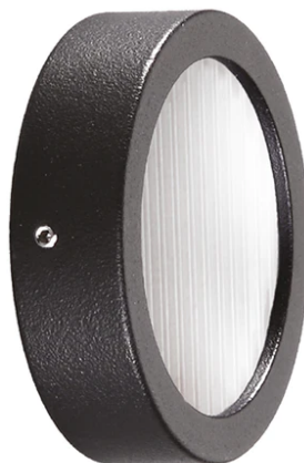
Elliptical Lens Spock 130 263.4