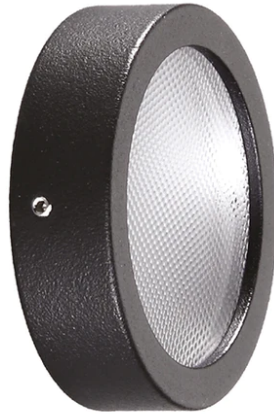
Flood Diffuser Spock 130 210.4