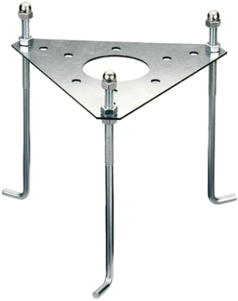
Base Plate and Fixing Bolts Silvia/Mini Silvia pole 21