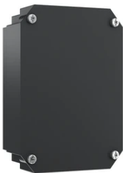
Box for installation for masonry or concrete wall F5962000