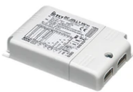
Power supply 24Vdc 17W / 110-240V (15W@110V) IP20 Class II selv. Dimmable 1-10V RF25750