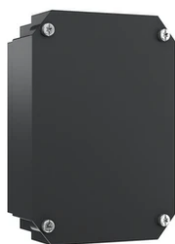
Box for installation for masonry or concrete wall F5962000