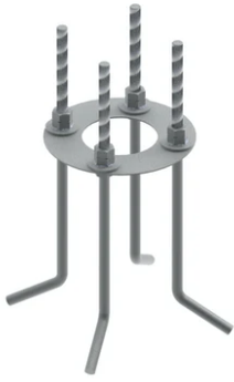
Base plate with bolt F023Z060000