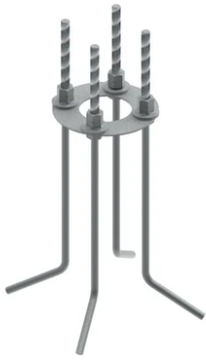
Base plate with bolt F023Z050000