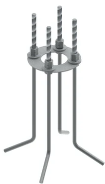
Base plate with bolt F023Z050000