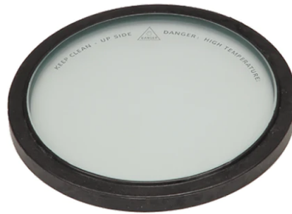
Sandblasted Glass Petra 233