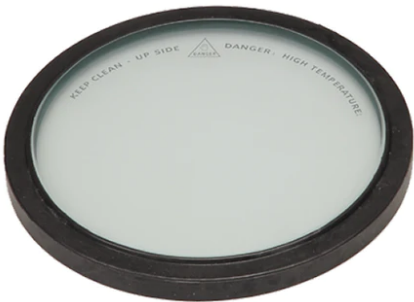
Sandblasted Glass Petra 233