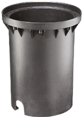
Box for Installation Petra/Idra 26