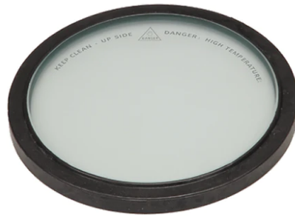
Sandblasted Glass Petra 233