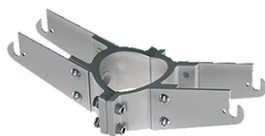
Pole Bracket Franco/Perseo 30 Ø 76 mm 180 mm Double 114.6