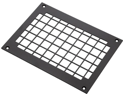
Antivandal Louvre Perseo 30 168.4