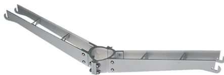
Pole Bracket Franco/Perseo 30 Ø 76 mm 500 mm Double 115.3