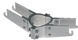
Pole Bracket Franco/Perseo 30 Ø 76 mm 180 mm Double 114.6